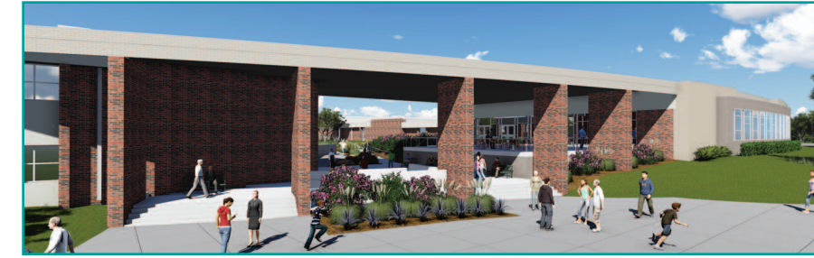
BROKEN ARROW HIGH SCHOOL AUDITORIUM