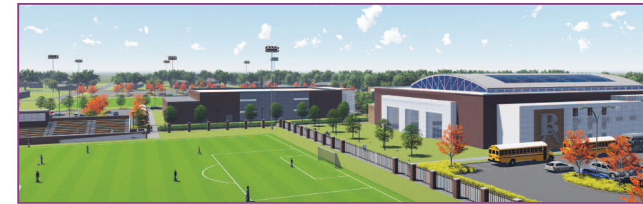
NEW MIDDLE SCHOOL